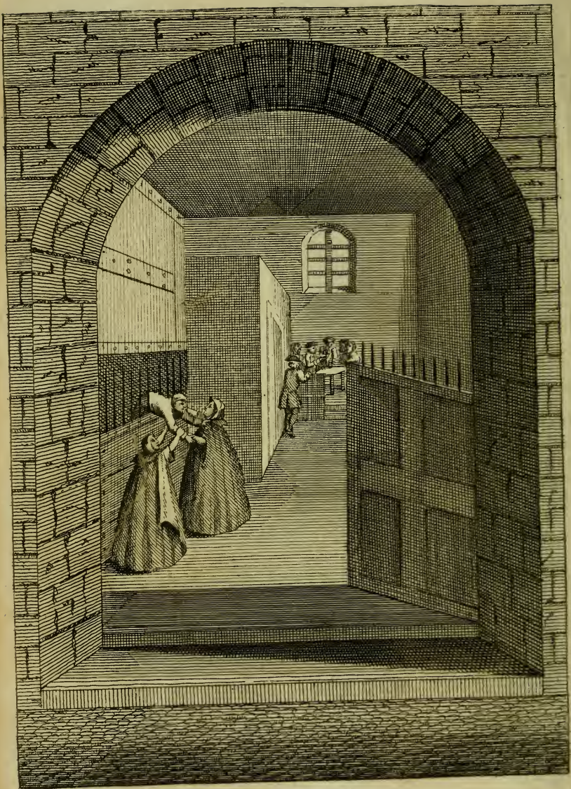
The manner of John Shepherd's Escape out of the Condemn'd Hole in Newgate.